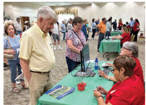
Rayle EMC members checked in during 2025 Annual Meeting Registration.